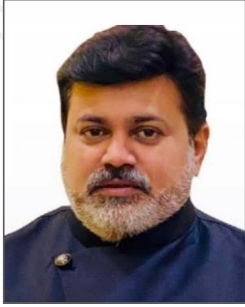
Shri. Uday Samant Hon'ble Minister for Higher and Technical Education, Govt. of Maharashtra.